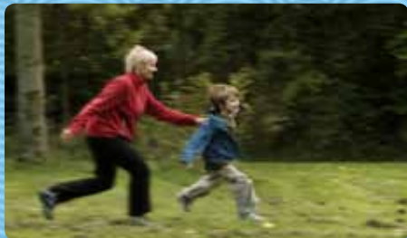
Rediscover the joy of Health in Motion.

Cultivate positive attitudes and health behaviors to stimulate you to embark on a life long commitment to your health and wellbeing.